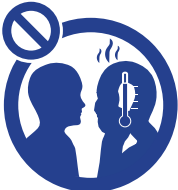
Do Not Meet Infected or Sick People