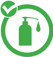
Use Soap or Hand Sanitizer