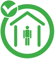
Stay at Home if Possible