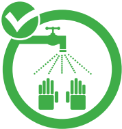
Wash Hands Thoroughly