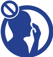
Do Not Touch Your Face esp. Mouth, Eyes, Nose