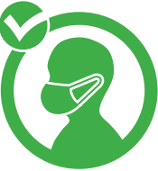
Use Face Mask or Respirator