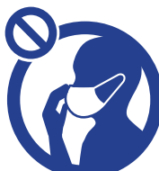
Do Not Touch The Front Part of a Mask