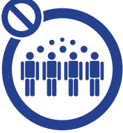
Avoid Large Crowds